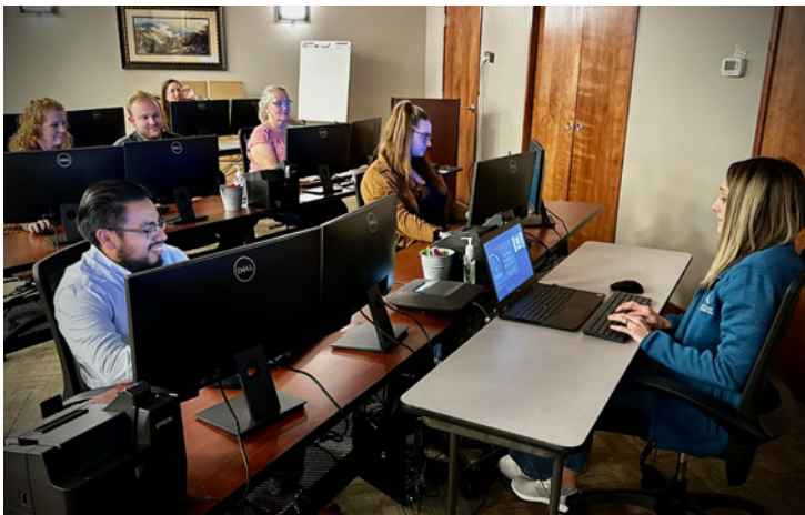
ATFCU staff training session